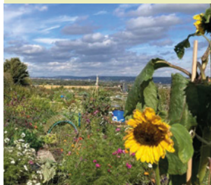
The Drury Lane Allotment site was purchased by the Parish Council in 2023

To work in partnership with Calderdale Council to enhance the pathway into Shaw Park from the Shaw Lane entrance.