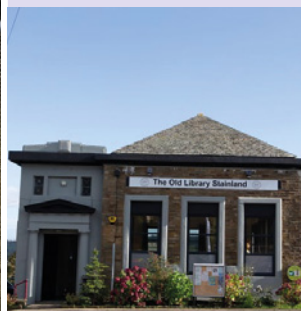
The Old Library in Stainland was asset transferred via the Parish Council who provided significant funding for the renovations carried out by the building's trustees and management committee.

Explore the merit of undertaking a Neighbourhood Plan for the area.