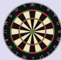
The Parish council have provided free darts sessions for youngsters in the area.