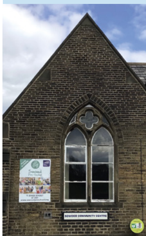
Sowood Community Centre is well used and well equipped but the fabric of the building could benefit from investment.

Work in partnership with Calderdale Council to improve local car parks and consider providing electric vehicle charging points.