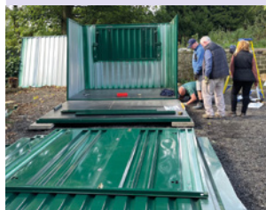
The Friends of Shaw Park assembling the Green and Keen Community Cabin which was part funded by a grant from the Parish Council.