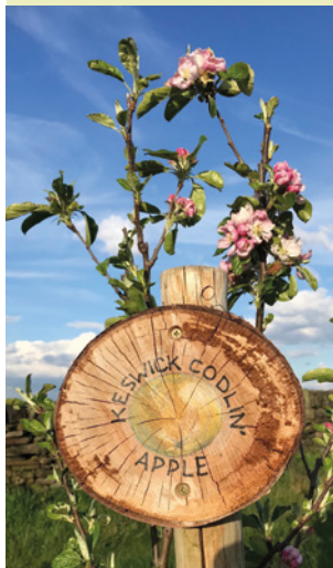
The first apple blossom in the Drury Lane Community Orchard created by the Parish Council with the aid of a grant from the Tree Council.

Offer free taster sessions for young teenagers – music, dance, drama, skills, craft workshops at various venues; community centres, parks, sports clubs.